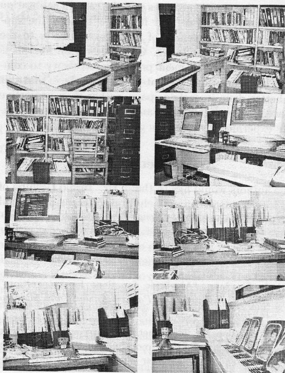
Figure 3: Eight equally spaced images (out of thirty-three) in the room sequence.

In performing our experiments we have drawn some conclusions about the best approaches for each step of the projective reconstruction process. We have also described a new way to locally filter invalid correspondences based on the disparity gradient. We believe that projective methods in combination with random sampling solve the correspondence problem for many image sequences. The support set of the fundamental