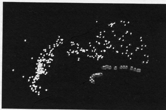
Figure 4: The 3D reconstruction of the camera positions and the corner points for the room sequence.